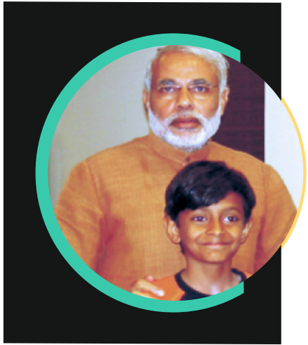
Shri Narendra Modi encouraging ALOHA Gujarat student's skill