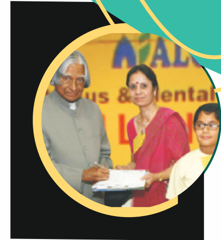
Late DR. A.P.J. Abdul kalam giving autograph to ALOHA students