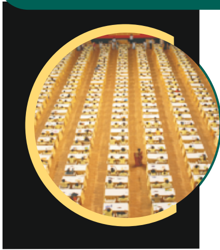
Grand view of ALOHA student at national competition in Surat