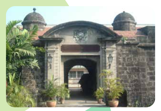
Intramuros, the Walled City, is the oldest district of Manila and is rich in culture and tradition.