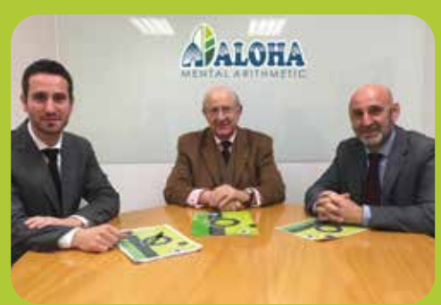
ALOHA Spain team

The adventurous spirit of Mr. Vila Horrach and the success achieved in Spain instigated the team to traverse the extra miles with the launch of the program in Europe.