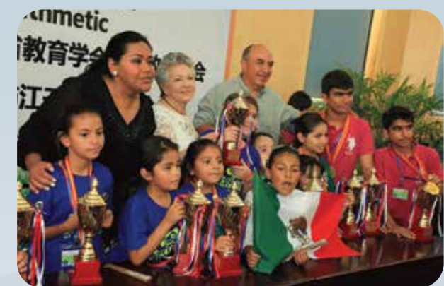
Marketing Ideas - Mexico