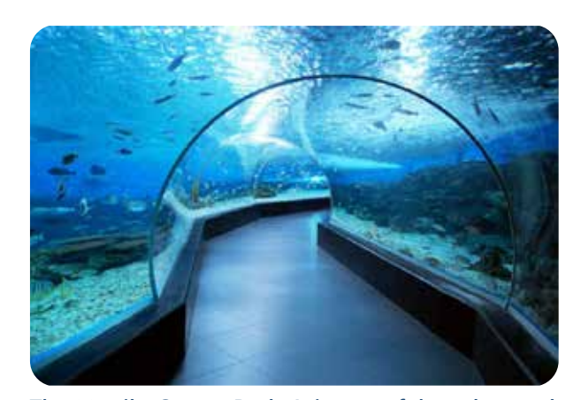
The Manila Ocean Park. It is one of the advanced ocean parks in Asia.