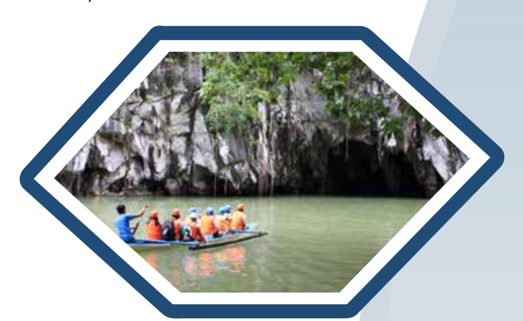
Puerto Princesa Underground River