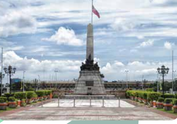
Manila Bay is located around the capital city of Philippines; Manila.