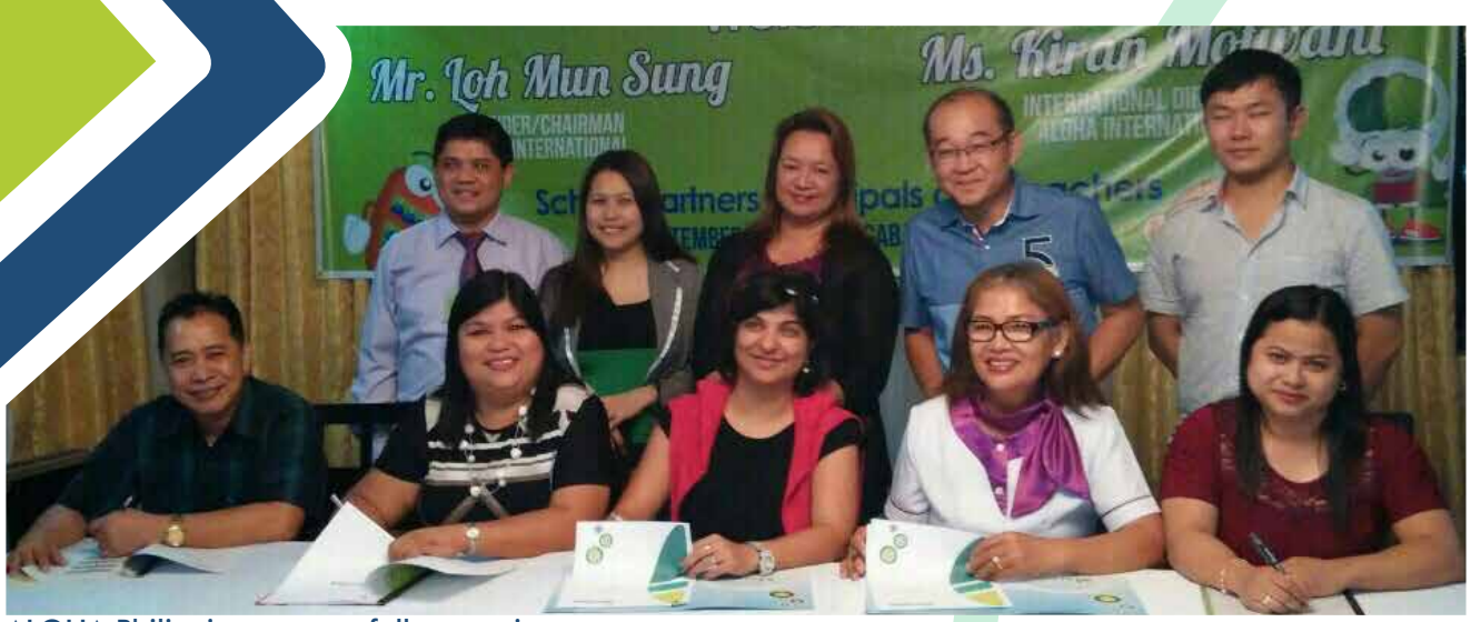
ALOHA Philippines successfull expansion

From its beginning in 1993, ALOHA Mental Arithmetic has been very successful. The first success was in Malaysia, the country of origin, with the endorsement of Malaysia Abacus and Mental Association (MAMAA) and the Abacus Association of Zhejiang (China).